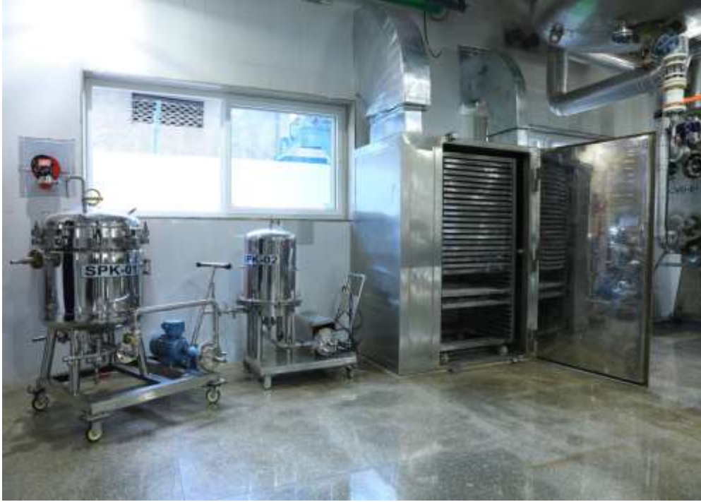
Sparkler Filter & TD Area