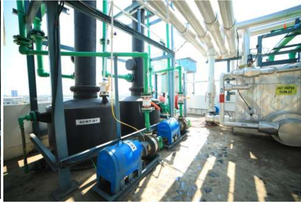
Hot water plant