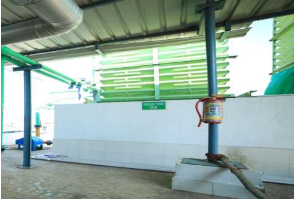
Cooling water plant